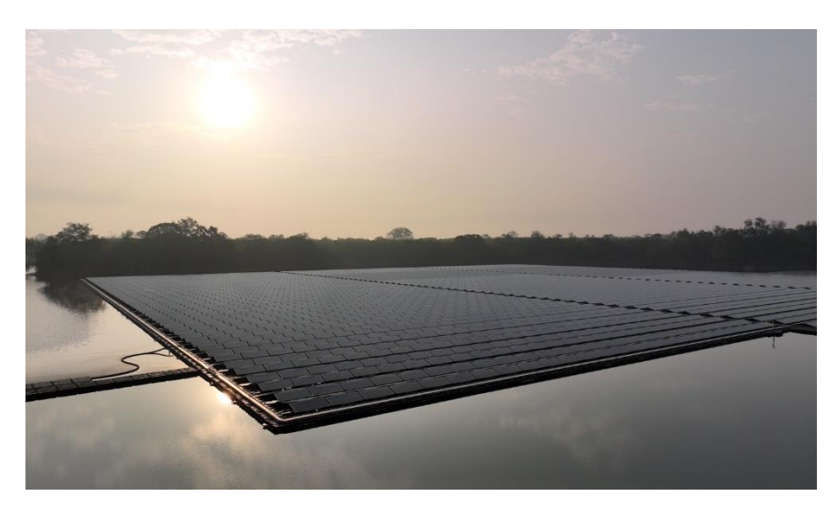
SCG Solar Power Generation

CJPT, which joined the agreement, is capitalized by Isuzu Motors Limited, Suzuki Motor Corporation, and Daihatsu Motor Co., Ltd. in addition to Toyota, and is promoting initiatives centered on logistics efficiency and electrification. A new company "CJPT-Asia" (tentative) will be established in Thailand as soon as the necessary procedures and preparations are in place, to further accelerate CJPT's carbon neutrality initiatives in Asia, including this collaboration. As part of CJPT's efforts in Asia, Hino Motors, Ltd. is also participating in exploring areas of contribution towards this collaboration. Since carbon neutrality should be tackled by all industries and all people in a joint manner, the three companies of SCG, Toyota and CJPT would like to further collaborate widely with partners who share the same view and intention towards carbon neutrality and giving back to Thailand.