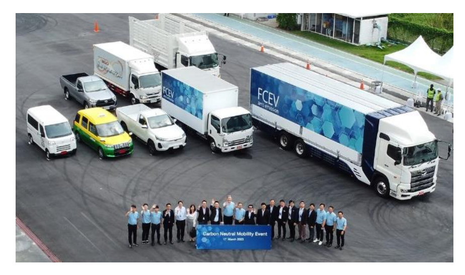
Carbon Neutral Mobility Event in Thailand