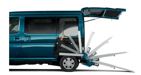
Forward-folding slope mechanism