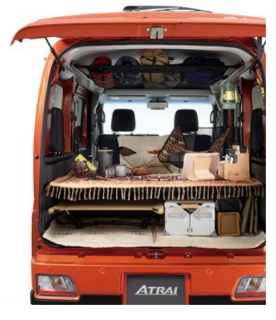
Luggage space usage image