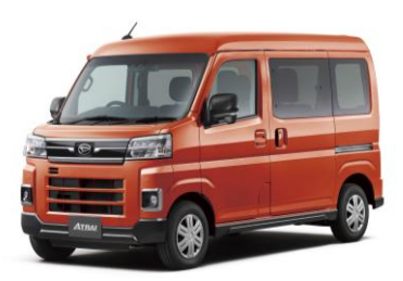
Hijet Cargo Deluxe