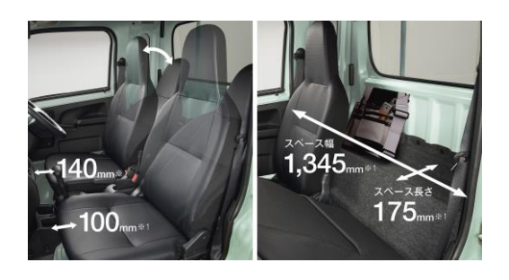
Reclining seat, seatback space