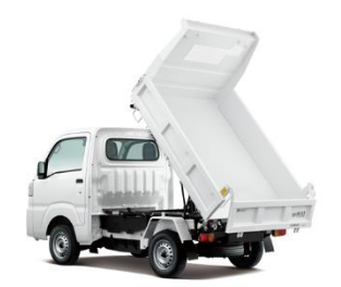
Multipurpose Dump (Dump Truck Series)