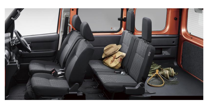
Seat usage image