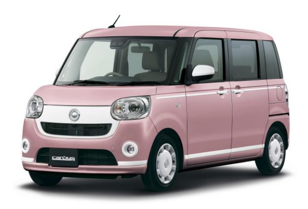
G "White Accent VS SA III"