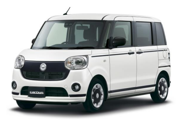
G "Black Accent VS SA III"

Daihatsu Motor Co., Ltd. (hereinafter "Daihatsu") has added the special edition "VS Series" to the lineup of its Move Canbus mini passenger vehicle, and will launch the vehicles nationwide on December 14.