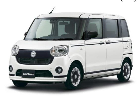
G "Black Interior VS SA III"