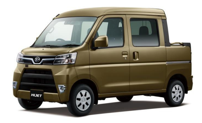
Hijet Deck Van G "SA III" (MT)

Daihatsu Motor Co., Ltd. (hereinafter "Daihatsu") announced today that it has partially upgraded its Hijet Cargo mini commercial vehicle, and will launch the updated vehicle nationwide on December 10.