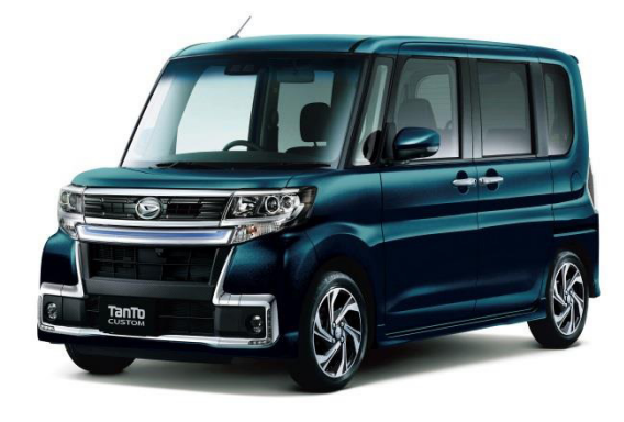
Tanto Custom RS "Top Edition VS SA III"

Daihatsu Motor Co., Ltd. (hereinafter "Daihatsu") has added limited edition "VS Series" grades to its Tanto line-up, and will launch the vehicles nationwide on December 3.