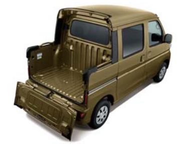
Rear view of Deck Van G SA III