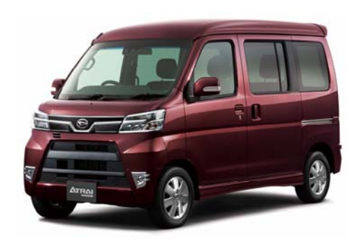
Atrai Wagon Custom RS Limited SA III

Daihatsu Motor Co., Ltd. (hereinafter, "Daihatsu") has announced partial redesigns to its Hijet Cargo mini commercial vehicle, Atrai Wagon mini passenger vehicle, Hijet Sloper, Atrai Sloper and Atrai Rear Seat Lift mini welfare vehicles, and its series of special purpose vehicles based on the Hijet Cargo. The company has also announced a partial upgrade to its Hijet Truck. The vehicles will go on sale nationwide on November 13.