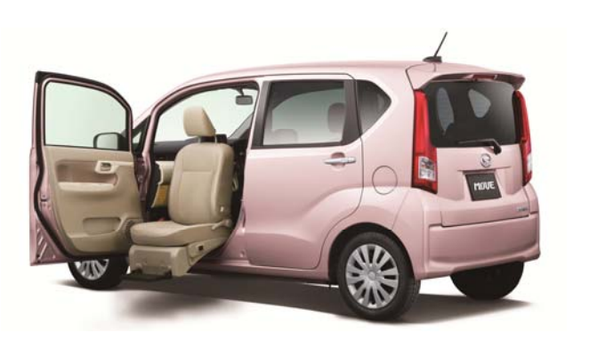
Move Front Seat Lift L