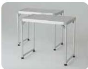
付属のアルミラック (Hi) W800mm×D450mm×H700mm