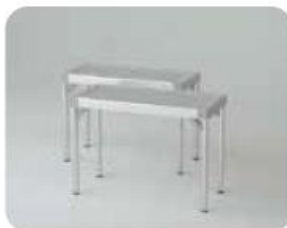
付属のアルミラック (Mid) W700mm×D300mm×H500mm