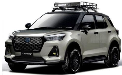
[Rocky CROSS FIELD Ver.]