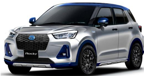
[Rocky Premium Ver.]