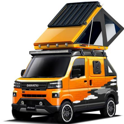
[Atrai Deck Van Camper Ver.]