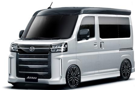
[Atrai Premium Ver.]