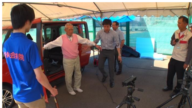
Scenes of industry-academia joint research

Daihatsu Motor Co., Ltd. (hereinafter “Daihatsu”) has newly developed through industry-academia joint research new equipment to reduce load on the elderly and extend their freedom of movement from the perspective of preventive care as an initiative in view of the future aging society. The new equipment will go on sale nationwide on July 9.