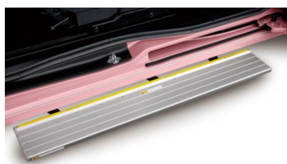
Miracle Auto Step