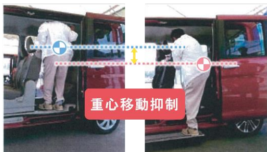
Previous vehicle (standard vehicle)