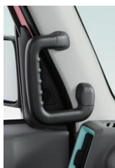
Rakusuma Grip (front-passenger seat)