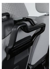
Rakusuma Grip (behind the driver’s seat and front-passenger’s seat)