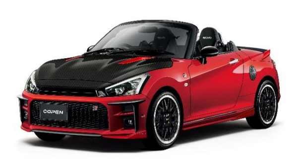
COPEN GR SPORT Custom Ver.