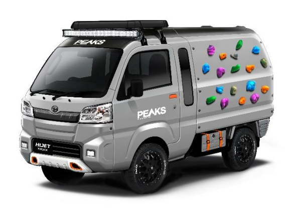
HIJET Truck PEAKS Ver.