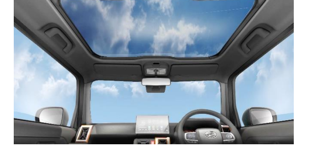
Front view of the TAFT Concept