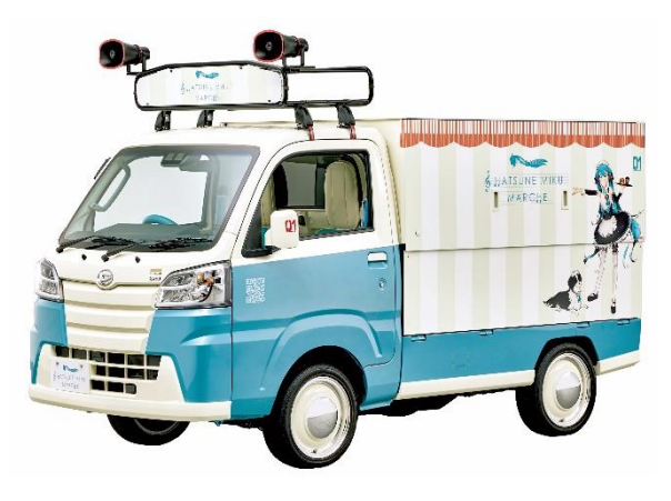
HIJET Truck Hatsune Miku Marche Ver.