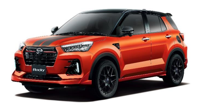
Rocky Sporty Style